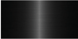
Black RAL 9005 glossy